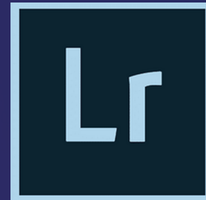
Photo editing software for photographers and creative professionals